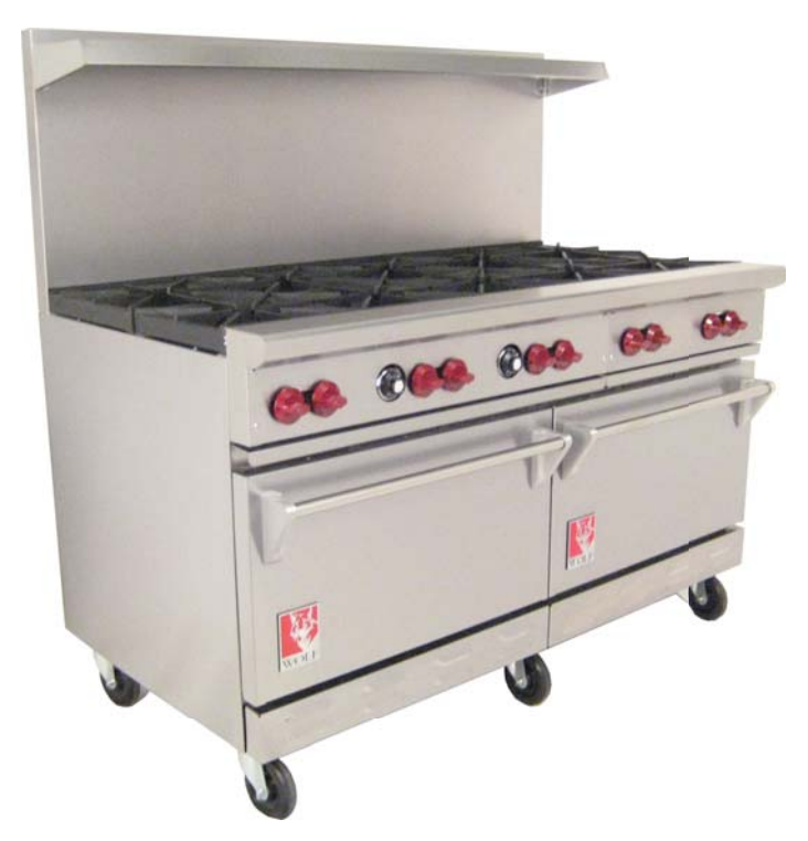
Model C60SS-10 shown with optional casters